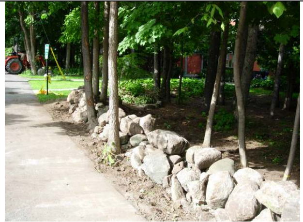
380 Springfield after cleanup of boulder line