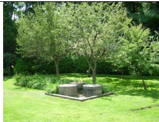
Jubilee Garden – the former Carnegie Library pediments can now be seen after overgrown Mugho Pines were removed.

The site now looks as it did many years ago. We used our part of our GPP grant to hire a local arborist and his energetic crew to chain saw and pull out by the roots the invasive Norway Maples along the Buena Vista side of the Community Hall up to the line of boulders. This has increased visibility into the Community Hall area (a great improvement from a public safety perspective) and will increase light so that flowers may eventually be planted there again (as was done in the mid 1990s but was not successful due to a lack of light). The arborist also chipped about a decade of accumulated bush and it is now available as mulch for use by the Village Gardeners. Commercial stump grinding in the wooded area in front of the Library and Community