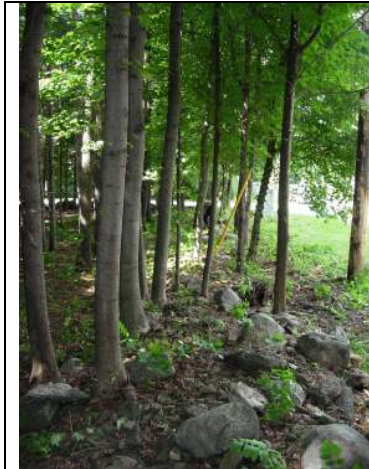
380 Springfield – before cleanup